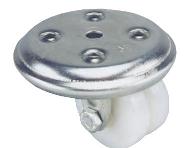
The Revvo Scene Shifter also can be fitted with low-profile, 2SL Series casters (shown with nylon wheels).

Scene Shifter Type B fitted with Revvo 4 Series, Revvothane wheel casters.